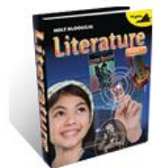
Holt McDougal Literature, Grade 7,