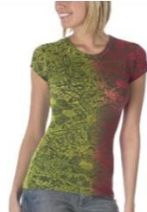
Shirts with sleeves ✓