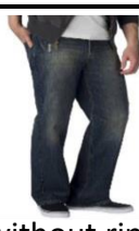
Jeans without rips/holes above your fingertips